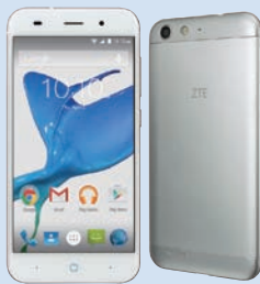
ZTE blade V6(Silver)

Use it as a second phone only for data, and you can get a great convenience together with the other mobile phone.