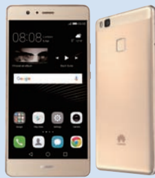
HUAWEI P9 lite(Gold)